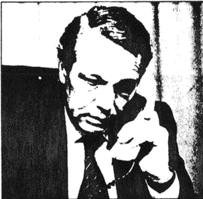
Joaquin Navarro-Valls, the director of the Holy See press office. It is his job to respond to the hundreds of media requests that pour in from the world's journalists each day. At right, the scene at a typical media conference.

Dr. Navarro-Valls shrugs off the criticism, and speaks warmly of his ties to the personal prelature known to enjoy the Pope's favor. "Opus Dei has taught me how to sanctify my job — whether